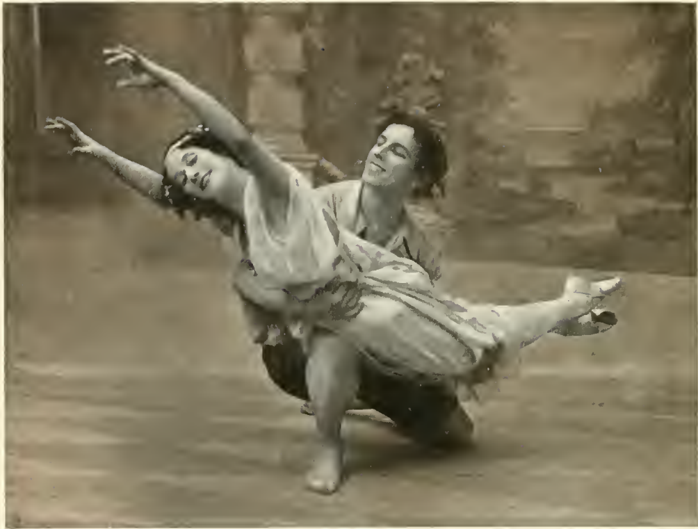
Dover Street Studios